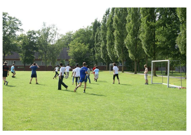
... and onto the lawn.