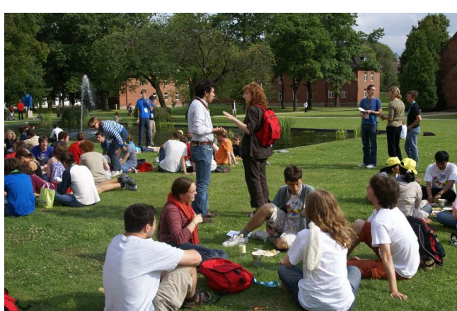
At the barbecue